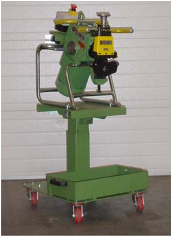
Carriage for big sheets.