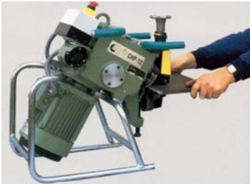
Small sheets feed manually.

Small sheet-pieces can be fed manually into the machine. For large sheets, we supply as option a so called “spring-loaded carriage”. The on this carriage mounted CHP-12 machine can be simply rolled against the sheet the milling cutter will “bite” itself to the sheet material and will transport itself along the sheet automatically.