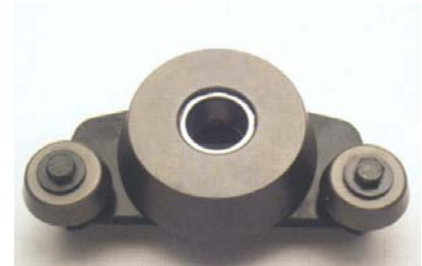
Diverse angles deliverable.