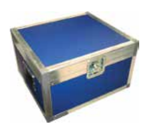
Durable storage and shipping case