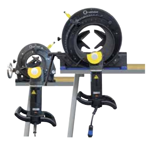
GFX 3.0, GFX 6.6