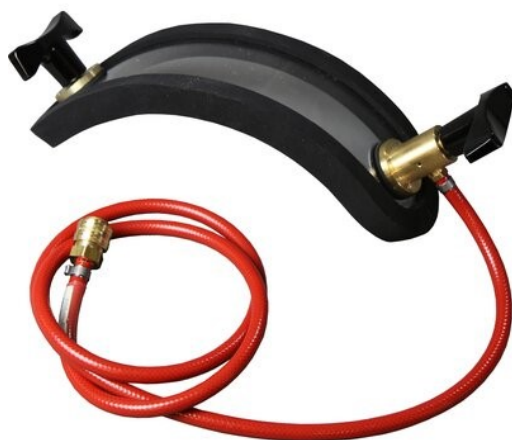
Vacuum box for pipe Ø mm: