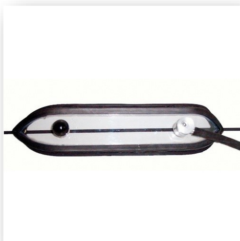
Vacuum box for rectangular round welding seam from tank diameter to flat plate: