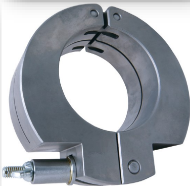
With Quick Lock

The Sawing Guide are the ideal equipment for square sawing of pipes.