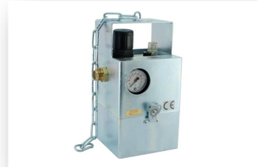
Air treatment box