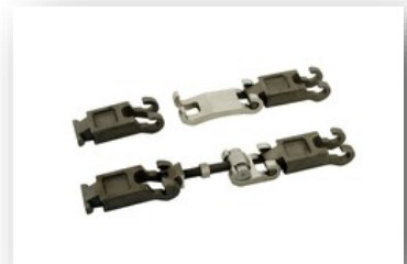
Guide chain assembly