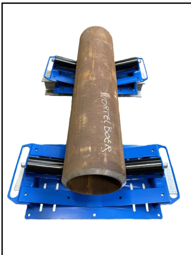
Single roller version for LENGTH rolling of the 10" pipe.

The roller block can be equipped with steel - blackened - rollers OR with steel rollers with a POLYURETHANE type P700 D coating of approx. 8.5 mm. thickness.