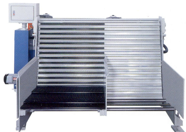
Loading system for the FDBM machine