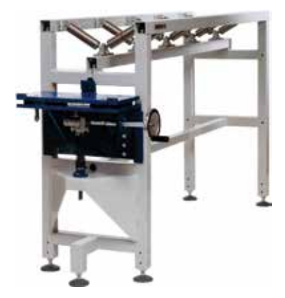
Pipe feeder base unit