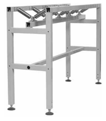
Pipe feeder extension unit