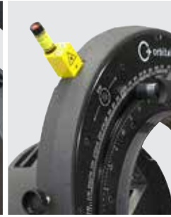
Integrated line laser to determine the cut off point