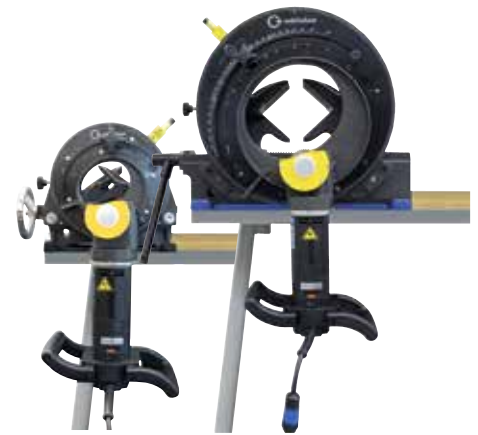
GFX 3.0, GFX 6.6

The technical data are not binding. They are not warranted characteristics and are subject to change. Please consult our general conditions of supply.