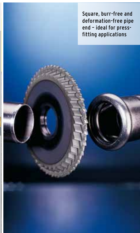
Square, burr-free and deformation-free pipe end - ideal for press-fitting applications

Our GFX series is the ideal solution for cutting of thin-walled tubes. The rugged design for a long product life makes the saws especially economical. Furthermore, the long tool lives thereby increase the productivity.