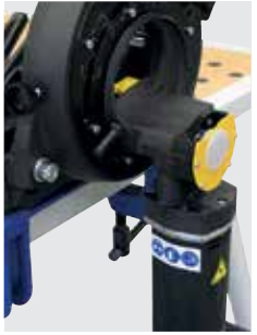
Second saw blade position to cut off elbows