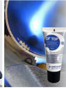
Saw blade lubricant GF TOP included