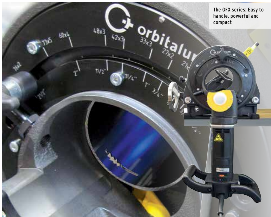
The GFX series: Easy to handle, powerful and compact

Innovative saws from Orbitalum Tools for cutting and beveling of tubes and for cutting off elbows (also for thin-walled stainless steel) in just seconds. The perfect preparation for orbital welding! Easy to use, powerful and compact saw with low weight - our new GFX provides even more outstanding features.