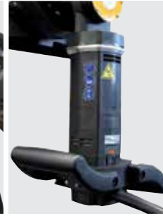
Powerful drive with electronic overload protection and ergonomically designed motor handle