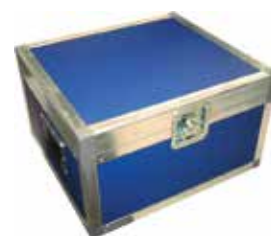
Durable storage and shipping case