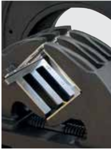
Cast iron clamping jaws with stainless steel caps