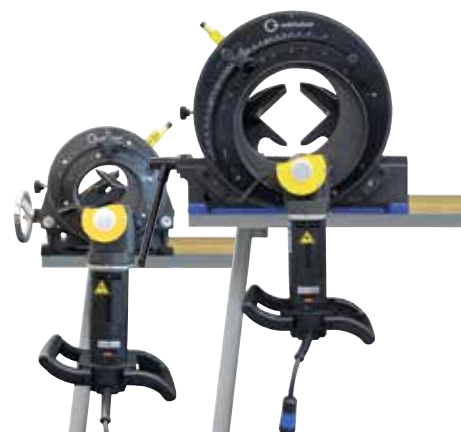
GFX 3.0, GFX 6.6